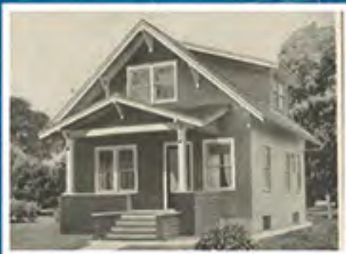
1907 Park Ave. Lewis La Veta

The Marina was a popular model for Sears, because it was small (24x25) and yet offered several appealing features, such as a beamed ceiling in the dining room, an oversized living room (24x12), and walk-in closets in the two bedrooms. Upstairs, the lone bathroom was situated within that front gabled dormer (with its large window). The two smaller windows flanking the large window provided light to the closets. In remodels, you'll often see these smaller windows closed-in but fortunately, the subject house is in mostly original condition.