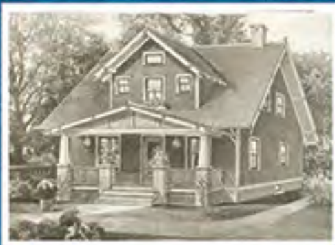
1859 Evergreen St. Sears Marina

The Marina was a popular model for Sears, because it was small (24x25) and yet offered several appealing features, such as a beamed ceiling in the dining room, an oversized living room (24x12), and walk-in closets in the two bedrooms. Upstairs, the lone bathroom was situated within that front gabled dormer (with its large window). The two smaller windows flanking the large window provided light to the closets. In remodels, you'll often see these smaller windows closed-in but fortunately, the subject house is in mostly original condition.