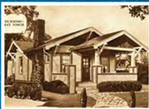
2317 State Street Sears Clyde

Lewis Homes (Bay City, Michigan) was one of six companies selling mail-order kit homes on a national level. The La Veta was one of their more modest designs, with about 800 square feet total (both floors combined). The catalog proclaimed that it had "an abundance of closet space" which consisted of cramped, dark spaces tucked under the second-floor eaves, and not so much as a single cabinet or closet on the first floor. The lone bathroom measured a mere six feet square.