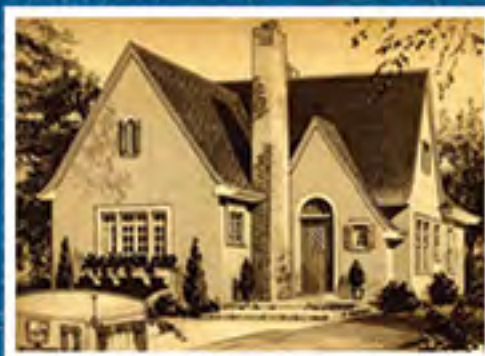
2334 Mound Street Montgomery Ward Wardway Patrician

First offered in the late 1910s, the Sears Clyde at 2317 State Street is close (if not beyond) its 100th birthday. In that time, it has been through significant remodelings. And therein lies one of the challenges of identifying these old kit homes - remodeling and improvements. If you study the original catalog image and compare it to the subject house, you'll see a Sears Clyde lurking under those modern accoutrements. At the height of its popularity (late 1920s), the Clyde was offered in three floorplans, with varying widths and lengths.